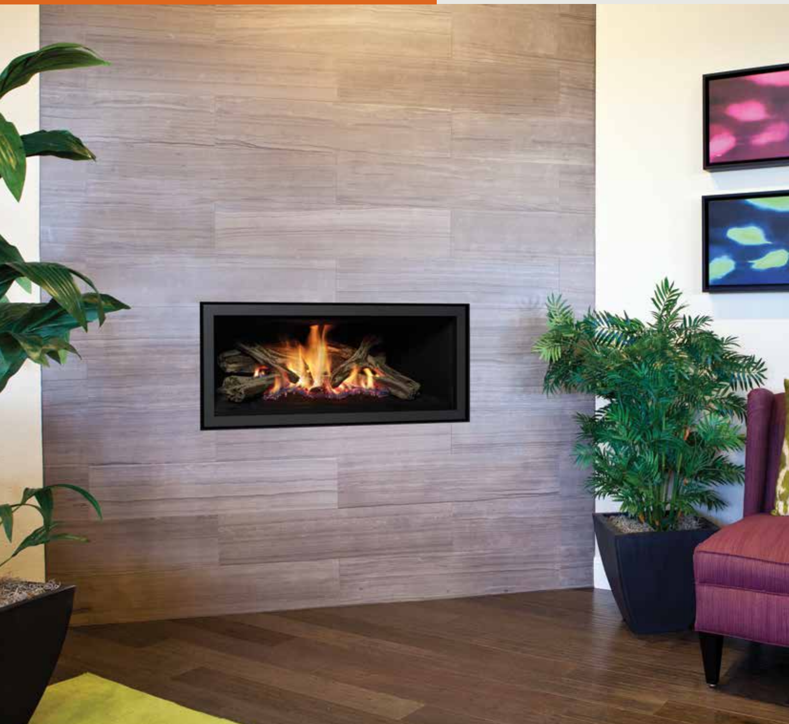
Regency Greenfire GF900L gas fire shown with a clean edge finish (shown without mandatory dress guard).