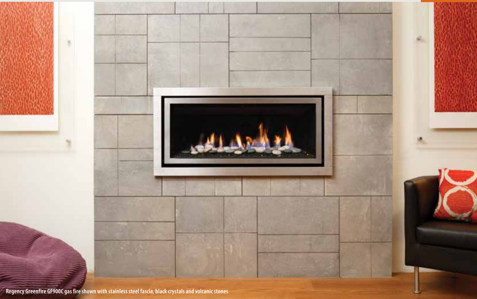
Regency Greenfire GF900C gas fire shown with stainless steel fascia, black crystals and volcanic stones