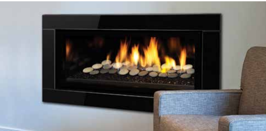
Regency Greenfire GF900C gas fire shown with premium glass fascia, black crystals and volcanic stones (shown without mandatory dress guard).